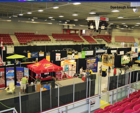
Don Lough Arena